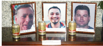
After the rescue