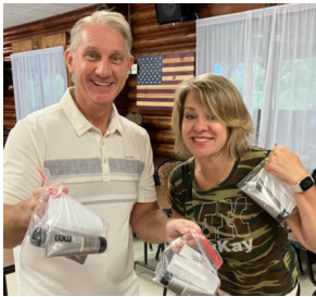
Happy Packing Faces!