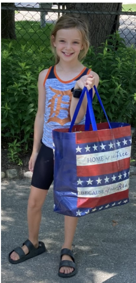
A delivery for DA Blue!

We always get thank you notes & pictures from our troops around the world who thank us for the miracle boxes they receive!