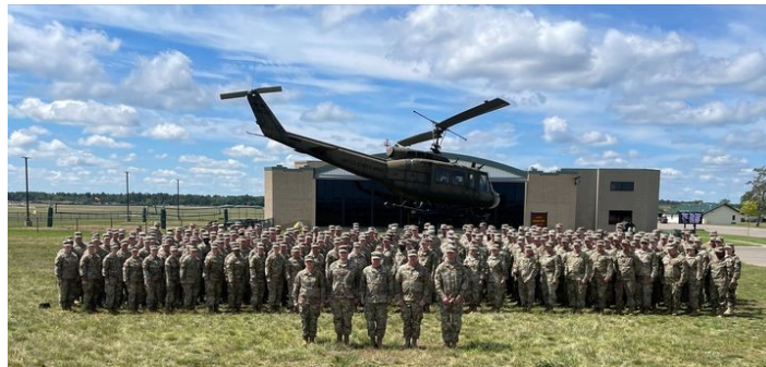
A thank you for the miracle boxes from the 379th

We always get thank you notes & pictures from our troops around the world who thank us for the miracle boxes they receive!