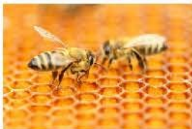
World of Bees