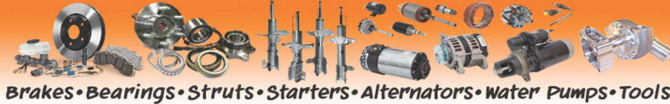
Brakes • Bearings • Struts • Starters • Alternators • Water Pumps • Tools